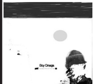
Boy Omega THE BEST TIME OF THE YEAR EP