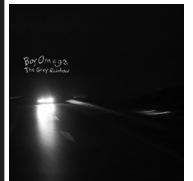
Boy Omega THE GREY RAINBOW