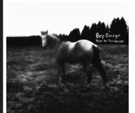
Boy Omega HOPE ON THE HORIZON