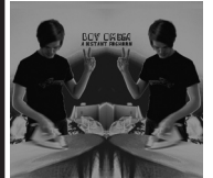
Boy Omega A DISTANT FOGHORN