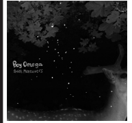
Boy Omega QUIET MANEUVERS EP