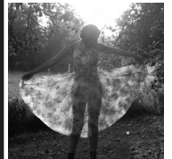
Boy Omega THE BLACK TANGO